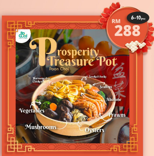
Wealthy Bowl / Poon Choi - RM288 (6 to 10pax) (abalone, prawns, oysters, scallops, smoked ducks, steamed chickens & vegetables)